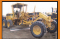
1 of 2 2003 JD 450HLGP

POLARIS 700 RANGER XP SN4XARD86A-46D817508 4x4, fuel injection gas engine, with dump body, Like New. 2005 JOHN DEERE SNW004X2X072143 gas engine, with utility bed.