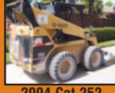
2004 Cat 252