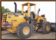
1 of 6 Komatsu WA320