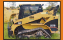
1 of 4 Cat 257B