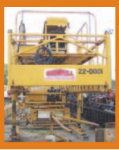
2001 Bidwell 4800

PRESORTED FIRST-CLASS MAIL U.S. POSTAGE PAID PERMIT NO. 307 SYRACUSE, NY