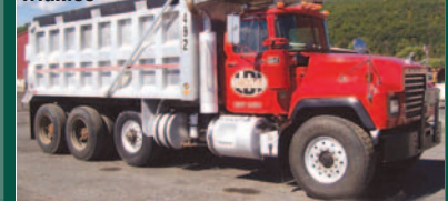
1 of 8 1998 Mack Triaxles

Albany International provides full commercial service and is a short drive from the sale site. Rental cars are available there as well.