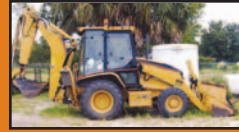
2005 Cat 420D