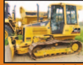
2006 Cat D3GLGP