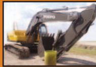
2000 Volvo EC210LC