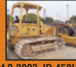
1 of 2 2003 JD 450HLGP