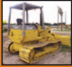
1999 Komatsu D31P-20