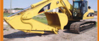
2005 Cat 325CL

(One of New York State's Premier Contractors)