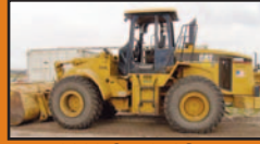
2003 Cat 950G-II