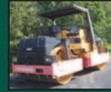
1998 Dynapac CC501