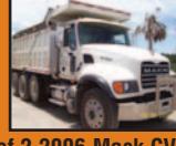
1 of 2 2006 Mack CV713