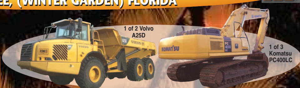
1 of 2 Volvo A25D

DAY 9 Sunday Feb. 8 Automobiles, Motorcycles, Boats, Exotic Cars, Recreational Vehicles, Tagalong Trailers, Hydraulic Excavators, Generators, Pumps, Landscape Equipment, Attachments for: Hydraulic Excavators, Motor Scrapers, Motor Graders, Rubber Tired Loaders, Tractor Loader Backhoes, Skid Steers, Forklifts, Crawler Tractors, Crawler Loaders and Truck Parts, Survey & Support Equipment.