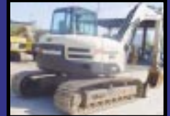
1 of 2 Ingersoll Rand ZX125

2000 KOMATSU PC220LC-6 SN55000 SERIES Komatsu diesel, w/Cab, aux. hydr. for tilt or thumb, 48in. digging bucket, quick attach, 30in. pads, long undercarriage.