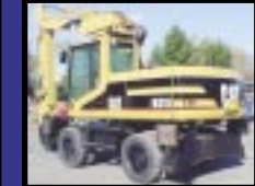
2000 Cat M318