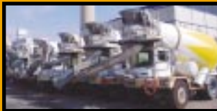
5 of 6 Advance Front Discharge Concrete Mixer Trucks

2007 FREIGHTLINER COLUMBIA SERIES VN25084 Mercedes diesel engine, 405HP, w/auto. trans., triaxle chassis w/air lift third axle, 16' Ox bodies dump body, hydraulic tarp, air operated tailgate, aluminum front wheels, 46,000lb. rears.