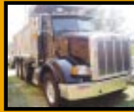
Brand New 2008 Peterbilt 365