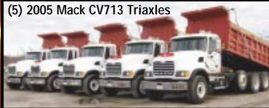
(5) 2005 Mack CV713 Triaxles

Smart Business Credit & Leasing: For instant credit approvals, contact Customer Service at 800.798.6862, or visit our on-site trailer at select auctions. Also available is a secure online application: www.smartbusinesscredit.com 100% financing or leasing & customized financial packages available ($10,000 minimum).