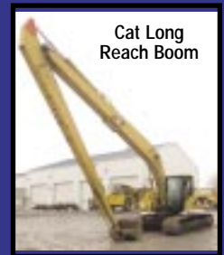
Cat Long Reach Boom

1999 HITACHI EX160LC-V SN13KP002034 Isuzu A4BG1T diesel engine, with Cab, air, reach boom, wide pads, digging bucket, long undercarriage.