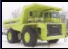
1 of 2 2000 Euclid R60C Large Quantity Concrete Forms

2005 KOMATSU PC220LC-7 SNA86538 Komatsu diesel, with Cab, air, 46" dig. bkt, 32" pads, long undercarriage.